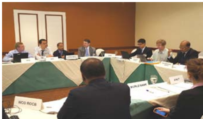
Deliberations at the annual ROC-TF Meeting, 29 October 2012, Colombo, Sri Lanka

To find out more about ROC-TF, please visit: http://www.unescap.org/tid/roctf.asp