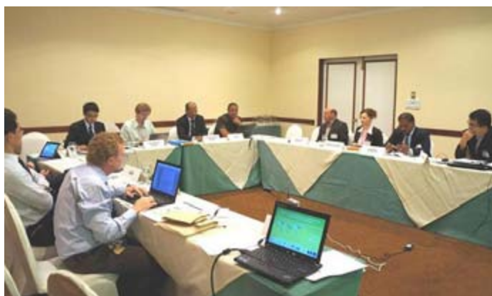
Participants at the ROC-TF meeting, Colombo, 29 October 2012, Colombo, Sri Lanka

The Annual Meeting of the Regional Organizations Cooperation Mechanism for Trade Facilitation (ROC-TF) was held on 29 October 2012 at the Galadari Hotel, Colombo, Sri Lanka on the side of the Asia Pacific Trade Facilitation Forum 2012. It was participated by eight international organizations working on Trade Facilitation in the Asia Pacific region, namely ADB, APEC, AFACT, ESCAP, OCO, SAARC, WCO and the World Bank. ASEAN and ECO, who could not join the meeting this year, submitted briefing papers on their activities in Trade Facilitation to the meeting.