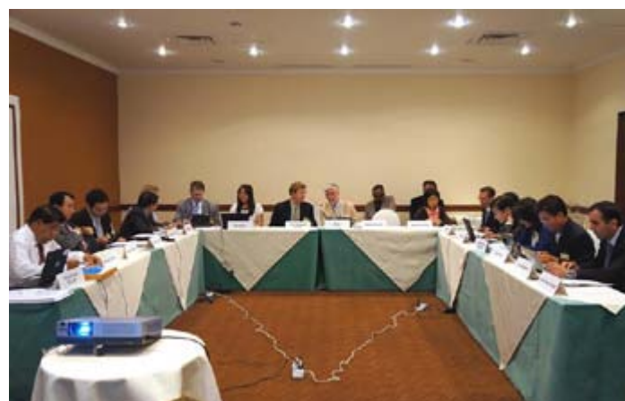
Participants at one of the side events, UNNExT Advisory Committee Meeting, 29 October 2012, Colombo

For the detailed summary, presentations and other information about the APTFF 2012 and back-to-back events, please visit: http://www.unescap.org/tid/projects/tfforum12.asp