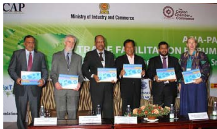
Dignitaries launched the UNNExT Capacity Building Kit for Single Window Implementation at the opening session of APTFF 2012

A total of nine events were organized back-to-back with the Forum during the week of 29 October – 2 November including a visit to the Colombo Port, SASEC Stakeholders Workshop on Subregional Trade and Transit Collaboration, UNNExT Advisory Committee Meeting, Expert Review Meeting on Regional Arrangements for the Facilitation of Cross-border Paperless Trade and the Asia-Pacific Research and Training Network on Trade (ARTNeT) Conference.